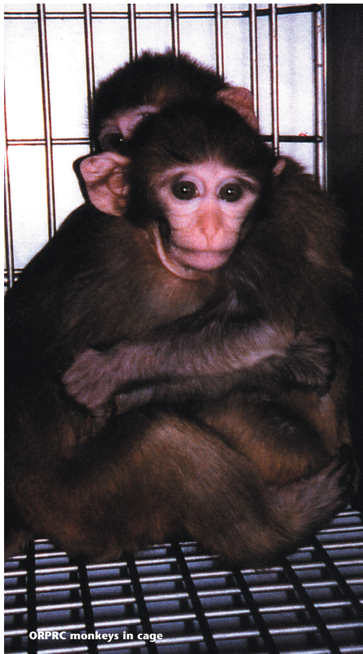
ORPRC monkeys in cage

For one test, Cameron implants a bulky transmitter and